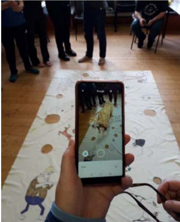
Appendix 6: Picture of blanket with journey of the bison